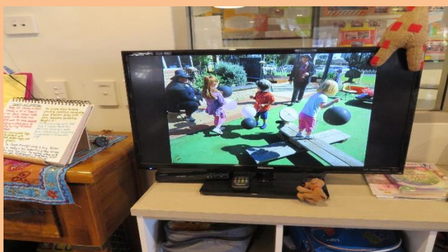
Daily Slide show

An 'interest sheet' will be going home to all families, to be used by your child's educators to extend your child's learning through their interests, this is a valuable tool in the development of our program, please return this form as soon as possible, your assistance is greatly appreciated. Family input sheets are also available near the daily diary for you fill out and return at any time.